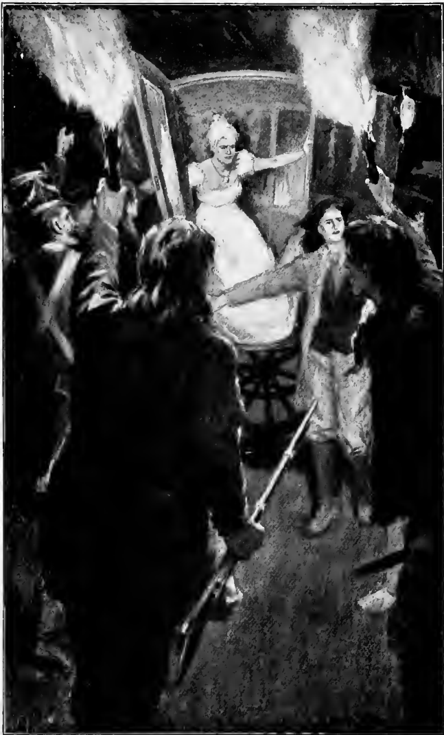
“Let Mademoiselle de Courtornieu pass without hinderance.”